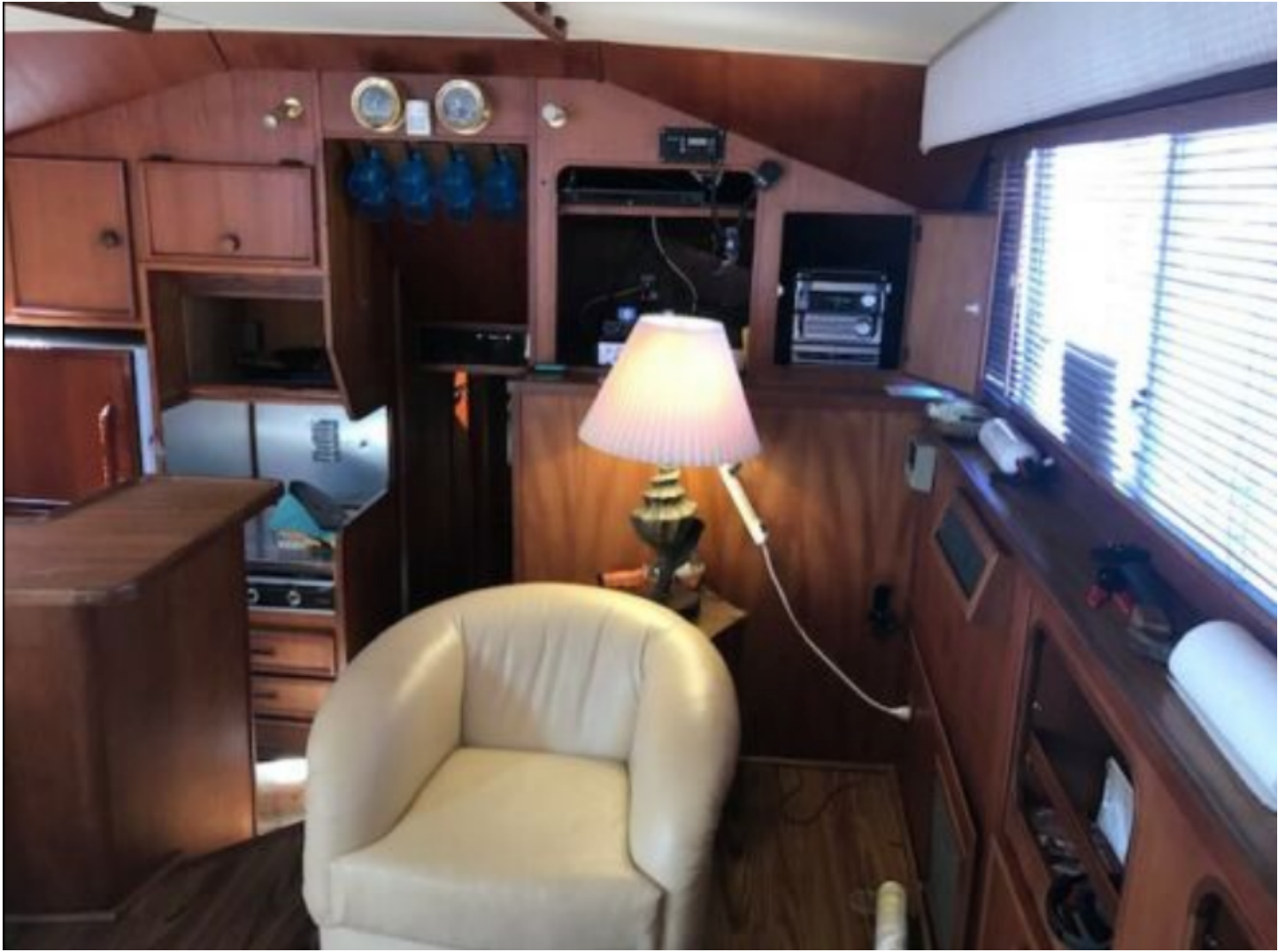
Salon Looking toward Bow