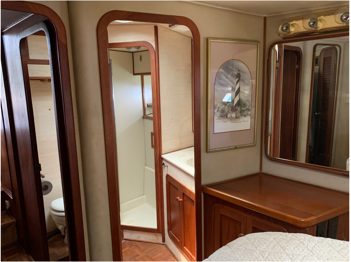
Stateroom Looking to Head