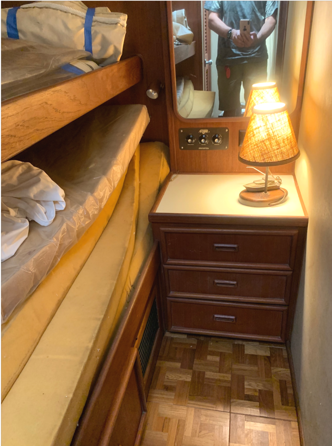
Stbd Side Bunk Room