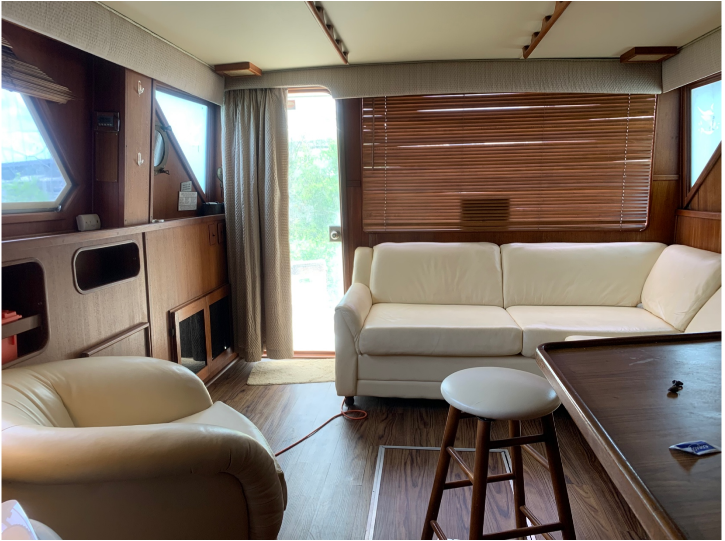
Salon Looking toward Stern