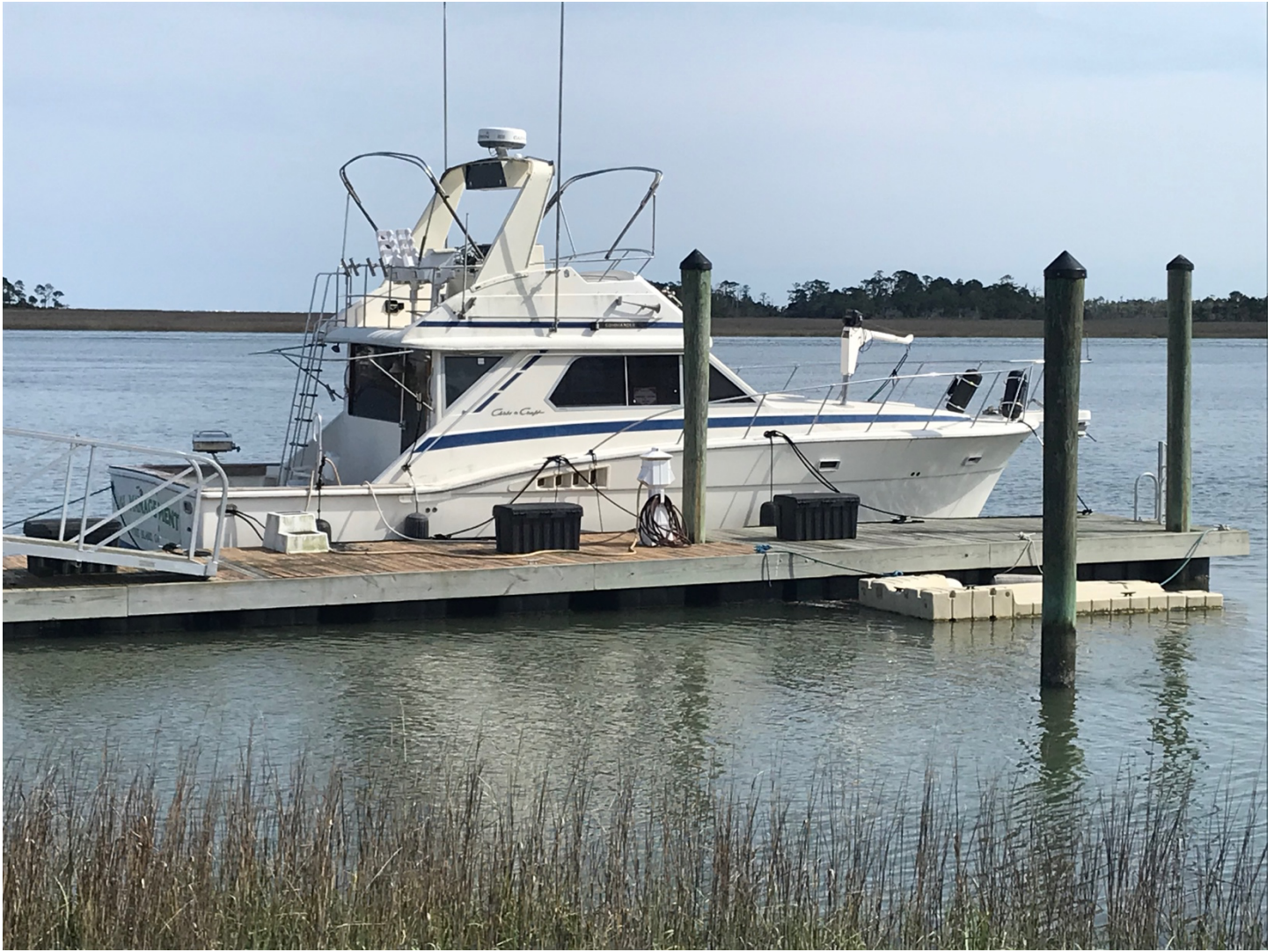
Side Profile in Water